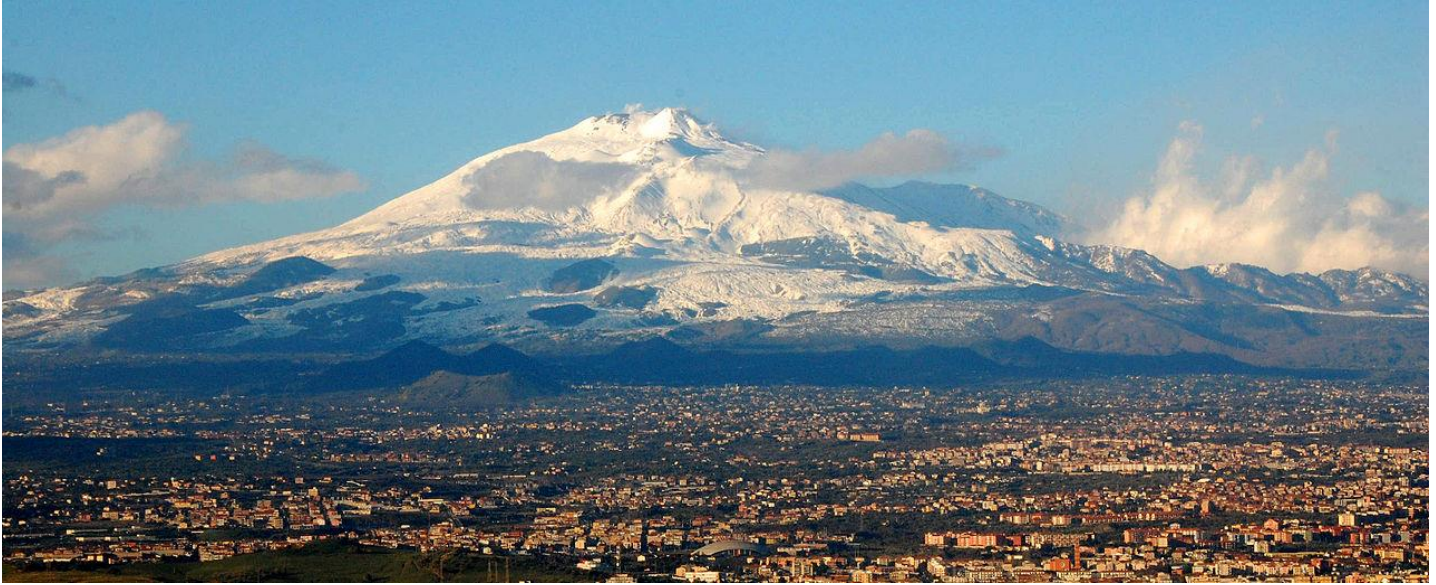
Mt. Etna with Catania in the foreground

Hotel Parco degli Aragonesi , situated in a garden near the shores of the Ionian Sea. Dinner in the hotel's restaurant.