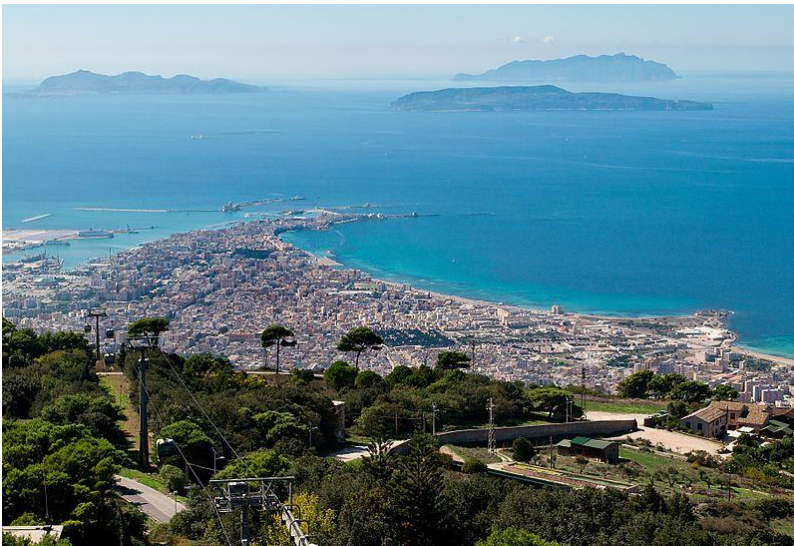
< View of Trapani and the Aegadian Islands from the hilltop town of Erice

Day 8 – Friday, March 12: Today we explore the extreme western region of Sicily, a fascinating landscape of windmills, salt pans, vineyards, and fascinating old towns, some founded by the Phoenicians about 3,000 years ago! We begin with a tour of the old town, harbour, and picturesque fish market of Trapani . Travel along a coastline sprinkled with salt flats and windmills to the seaport of Marsala . Here we visit historical Cape Lilibeo as well as an excellent museum, featuring the “ Marsala Ship ” the earliest warship known from archeological evidence, a Carthaginian warship discovered in 1971. Marsala produces a sweet wine, made famous by English merchants in the 19 th century, so we dutifully drop into a local cantina to taste this delicious product! In the afternoon, visit to Erice , a small medieval town situated atop a cliff rising abruptly 750 meters above sea level. We enjoy breathtaking views, possibly as far as the coast of North Africa, from the ruins of the castle, built on the foundations of a temple dedicated to Astarte, the Phoenician Aphrodite, allegedly associated with ‘sacred prostitution’. Erice is the perfect place to enjoy a mid-afternoon gelato or cappuccino break and to try some pastries in the famous shop of Maria Grammatico. Return to our hotel in the early evening.